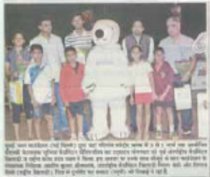
ಈ ಸಂದರ್ಭದಲ್ಲಿ ಮಕ್ಕಳಿಗೆ ಬ್ಯಾಡ್ಮಿಂಟನ್ ಪಂದಿಗಳನ್ನು ಆಡಲು ಅವಕಾಶವಾಯಿತು. ಈ ಸಂದರ್ಭದಲ್ಲಿ ಮಕ್ಕಳಿಗೆ ಬ್ಯಾಡ್ಮಿಂಟನ್ ಪಂದಿಗಳನ್ನು ಆಡಲು ಅವಕಾಶವಾಯಿತು.