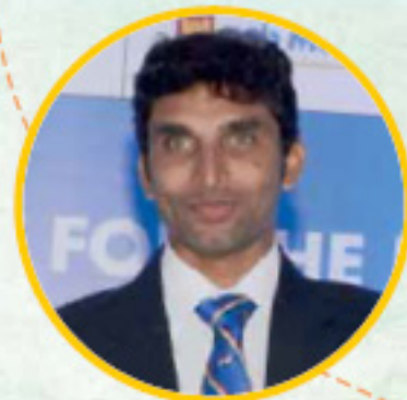
▲ B. Anand Kumar International Paralympic Badminton Player (World No. 2 in 2013) and Ekalavya Awardee for 2014