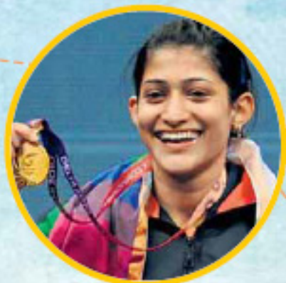
Ashwini Ponnappa International Indian Badminton Player

“ It is really amazing to see such a big platform for the young juniors. The current situation of the junior players might be lacking behind the seniors, so this a really good platform for them to get the requisite exposure they will need to play in the international circuit. ”