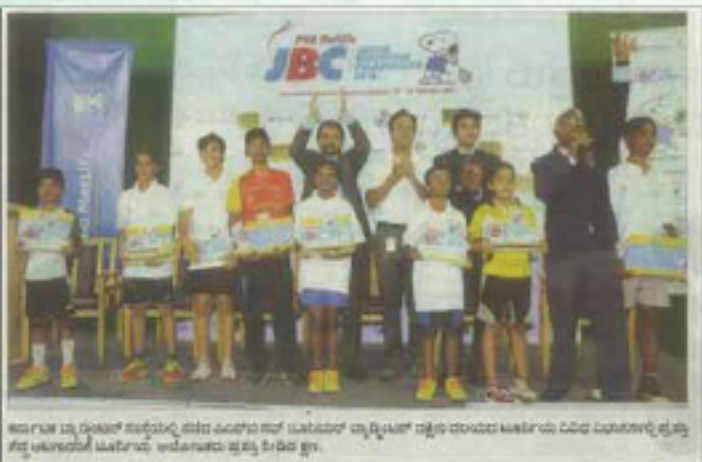
ಈ ಸಂದರ್ಭದಲ್ಲಿ ಮಕ್ಕಳಿಗೆ ಬ್ಯಾಡ್ಮಿಂಟನ್ ಪಂದಿಗಳನ್ನು ಆಡಲು ಅವಕಾಶವಾಯಿತು. ಈ ಸಂದರ್ಭದಲ್ಲಿ ಮಕ್ಕಳಿಗೆ ಬ್ಯಾಡ್ಮಿಂಟನ್ ಪಂದಿಗಳನ್ನು ಆಡಲು ಅವಕಾಶವಾಯಿತು.