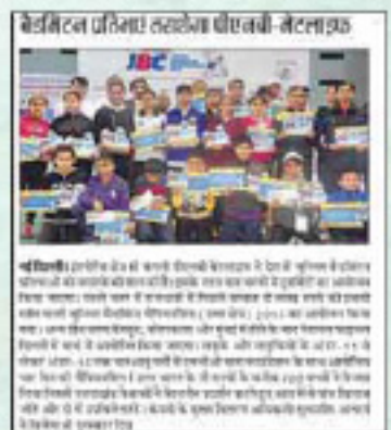
Publication: Hindustan, Delhi Date: February 10, 2015