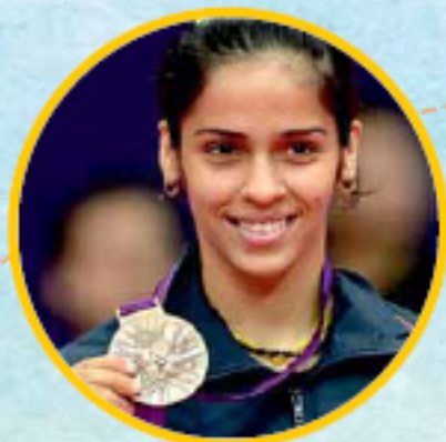
Saina Nehwal International Indian Badminton Player Ranked No. 1 by BWF