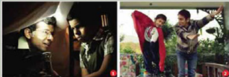
Publication: Brand Equity-ET, Delhi Date: February 11, 2015

Here is a glimpse of the massive Press Coverage: