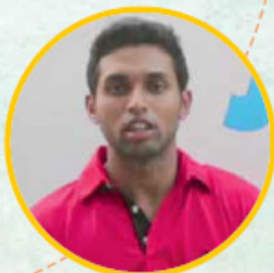
Prannoy H.S. International Indian Badminton Player

“ It is really amazing to see such a big platform for the young juniors. The current situation of the junior players might be lacking behind the seniors, so this a really good platform for them to get the requisite exposure they will need to play in the international circuit. ”