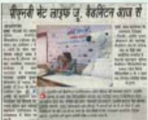
Publication: Navbharat Times, Mumbai Date: March 3, 2015