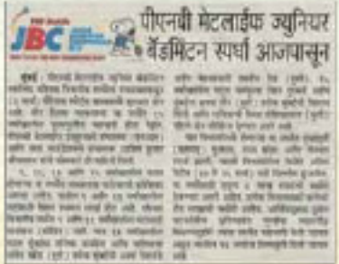
Publication: Prahaar, Mumbai Date: March 3, 2015