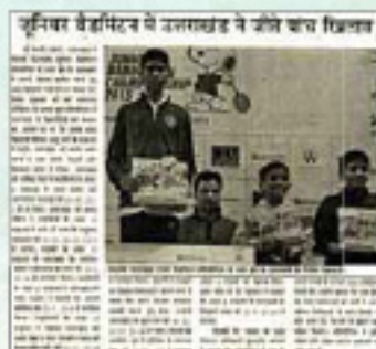
Publication: Veer Arjun, Delhi Date: February 10, 2015

P NB MetLife, a leading life insurance company, recently announced its association with Charles M. Nelson's iconic character Snoopy for the PNB MetLife Junior Badminton Championship. The Hong Kong based MetLife has been associated with the character for many years in other markets, including India in one of its previous avatars, Commercial Union Assurance (Cora) category. "Associating my iconic character Snoopy (Cora) category) as people do not necessarily remember a child ad." Snoopy has all the right attributes - it is trusting, approachable and happy. It also sets the stage for a debate raging between insurance brands who are adopting these fun + vibrant world of children's associations in their marketing strategies.