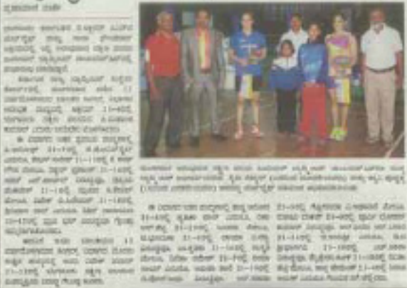
Publication: Prajavani, Karnataka Date: February 11, 2015