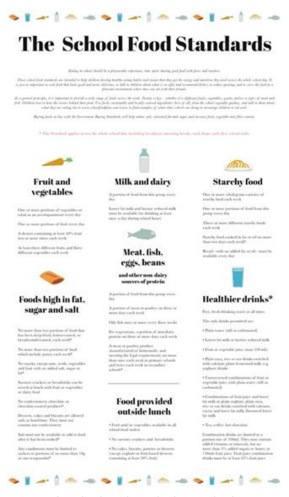
Figure 2 The School Food Standards in England

A summary of the standards and a practical guide are available at school food standards: resources for schools<sup>18</sup>. They set out a food-based approach "designed to make it easier for school cooks to create imaginative, flexible and nutritious menus". They also include recommended portion sizes.