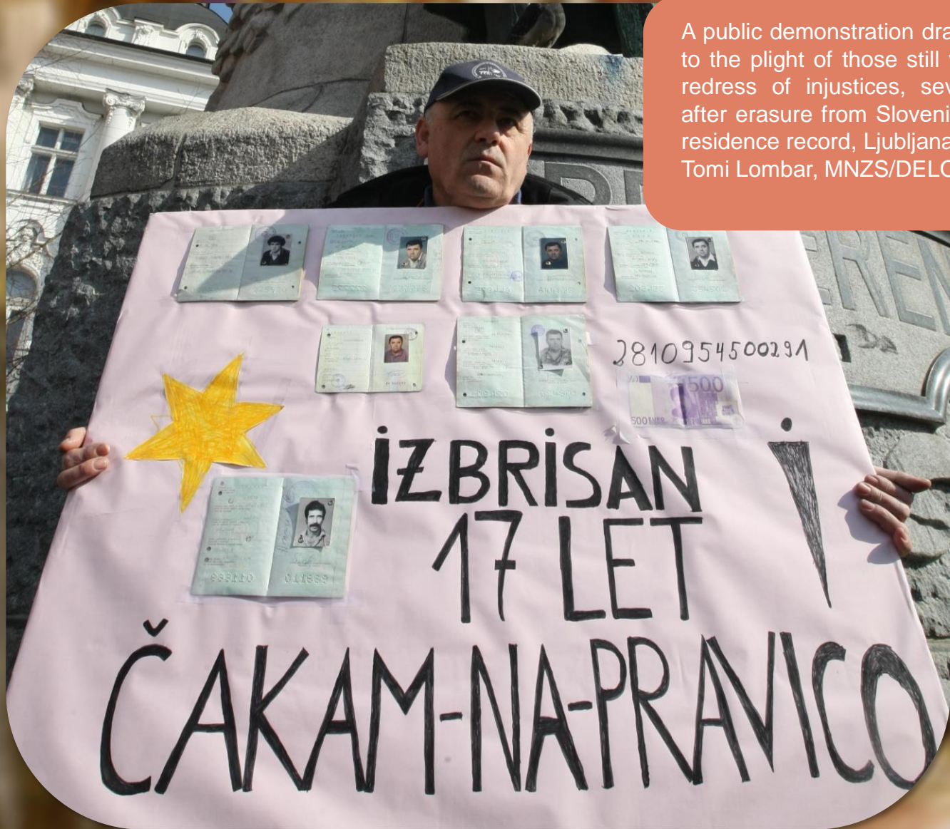
A public demonstration drawing attention to the plight of those still waiting for the redress of injustices, seventeen years after erasure from Slovenia's permanent residence record, Ljubljana, 2009.