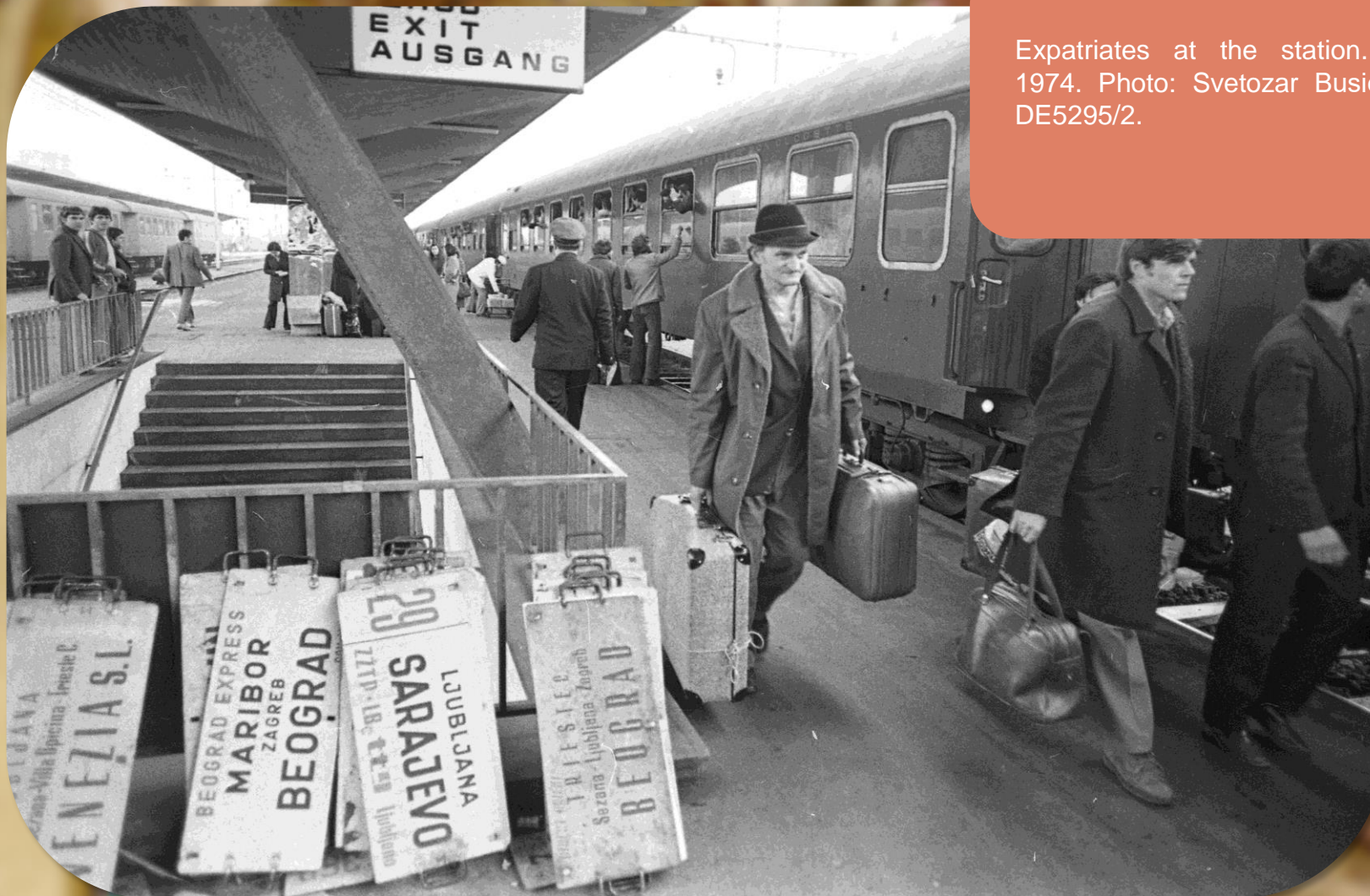
Expatriates at the station. Ljubljana, 1974. Inv. no.: DE5295/2.