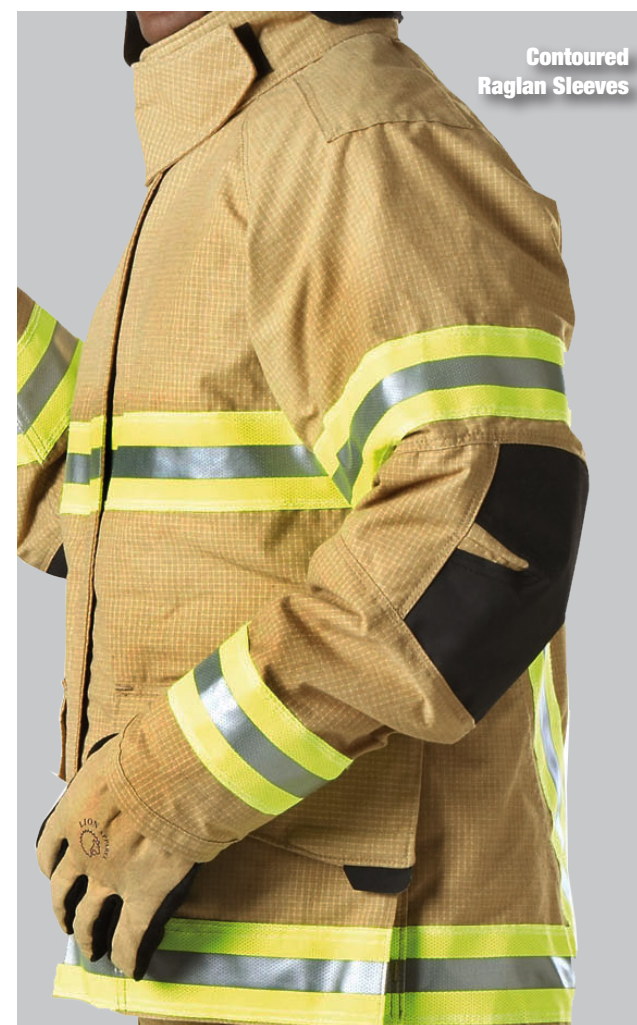
Contoured Raglan Sleeves