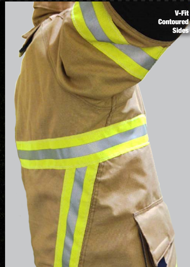
V-Fit Contoured Sides

Provides a conduit for the release of vapor and guards against the potential hazards of trapped moisture. It's also more flexible than traditional reflective trim.