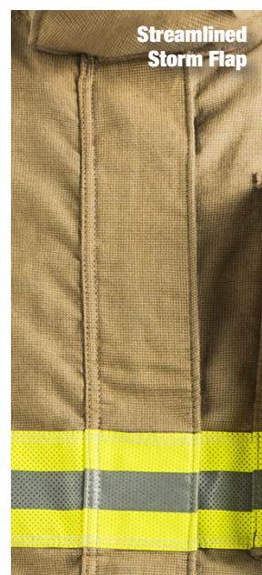
Streamlined Storm Flap