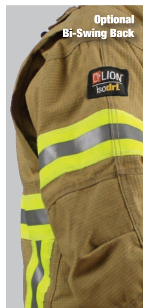
Optional Bi-Swing Back