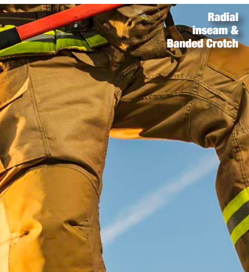
Radial inseam & Banded Crotch