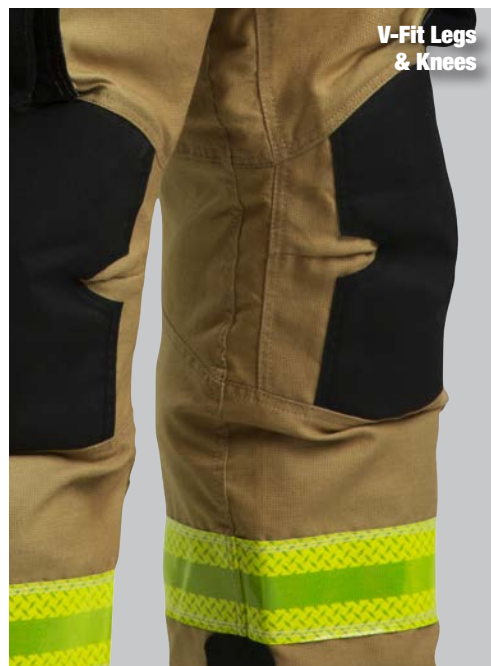
V-Fit Legs & Knees