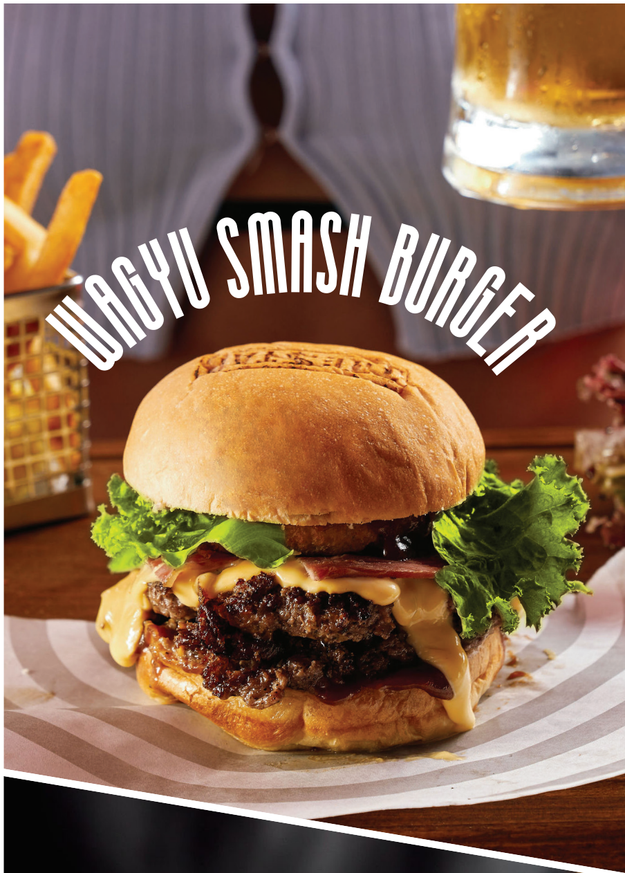
WAGYU SMASH BURGER