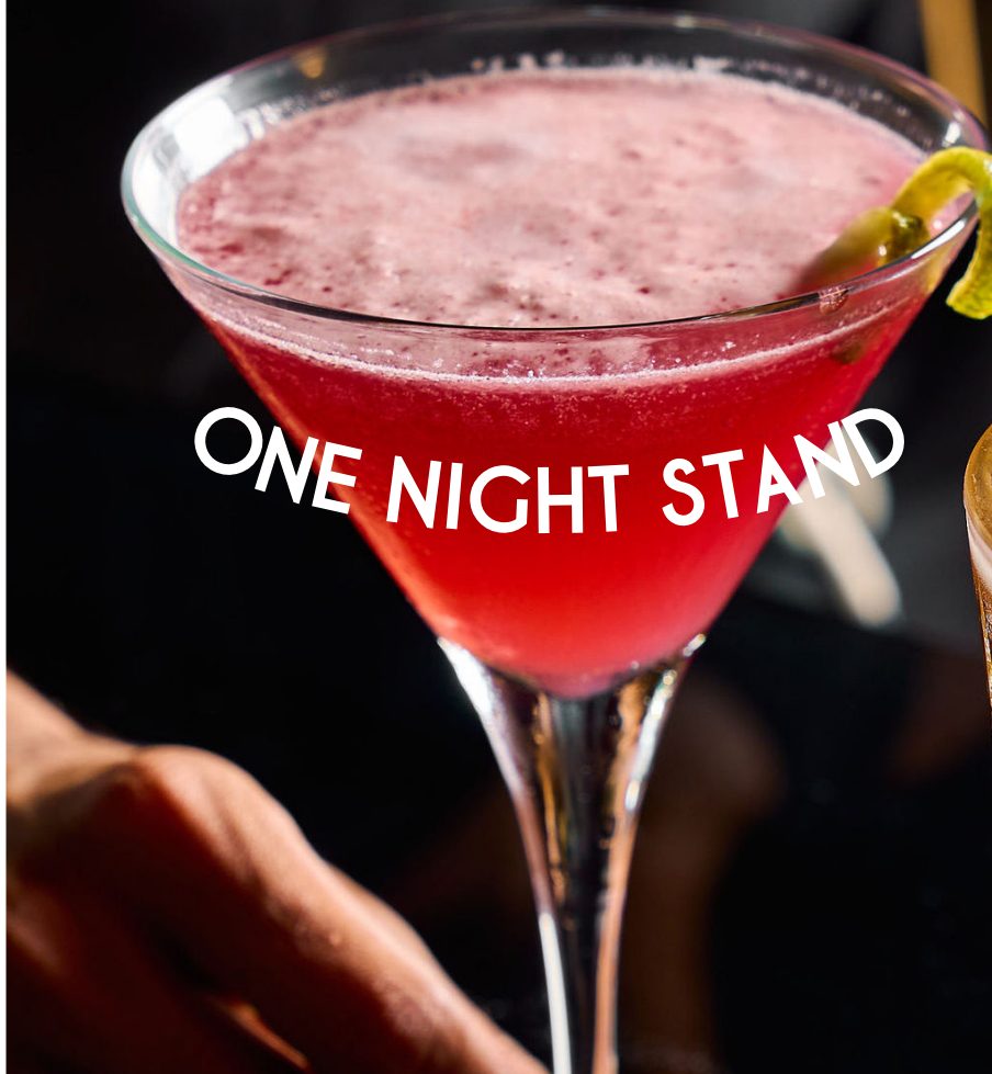
ONE NIGHT STAND