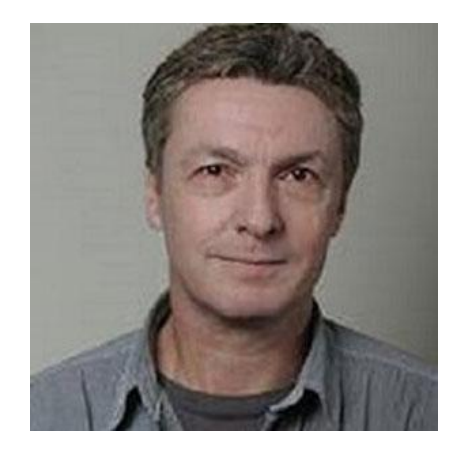
General Director MSF India