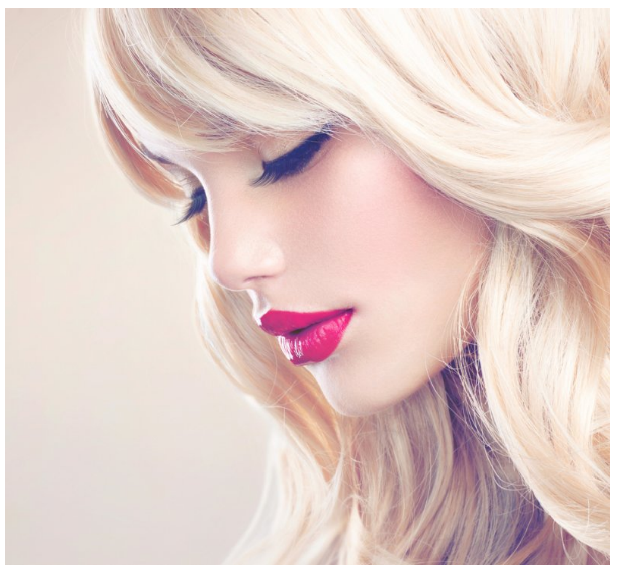
Source of information: https://www.goodhousekeeping.com/beauty/anti-aging/a34301/best-skin-care-tips/

If you are interested in this subject please visit beauty tools.