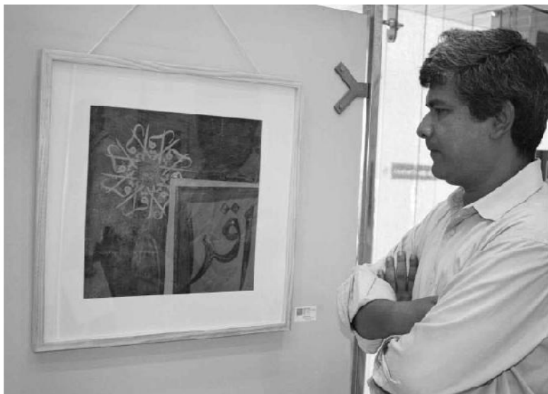
“Read - a painter’s salute to reading”