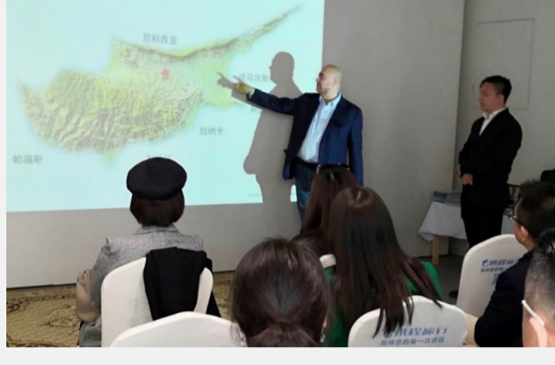
Establishing our new representative office in China.