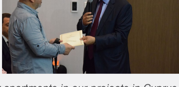
Clients receiving the Title Deeds for their apartments in our projects in Cyprus.