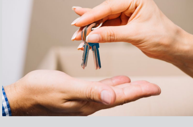
In order to serve you better, Plus Properties now offers two new services in Cyprus: Renovation & Short-Term Rental