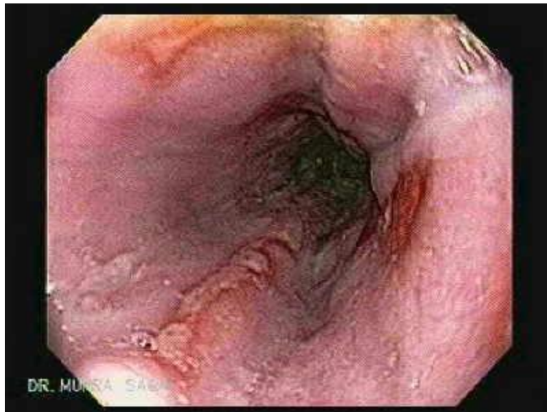
Esophagitis and esophageal ulceration