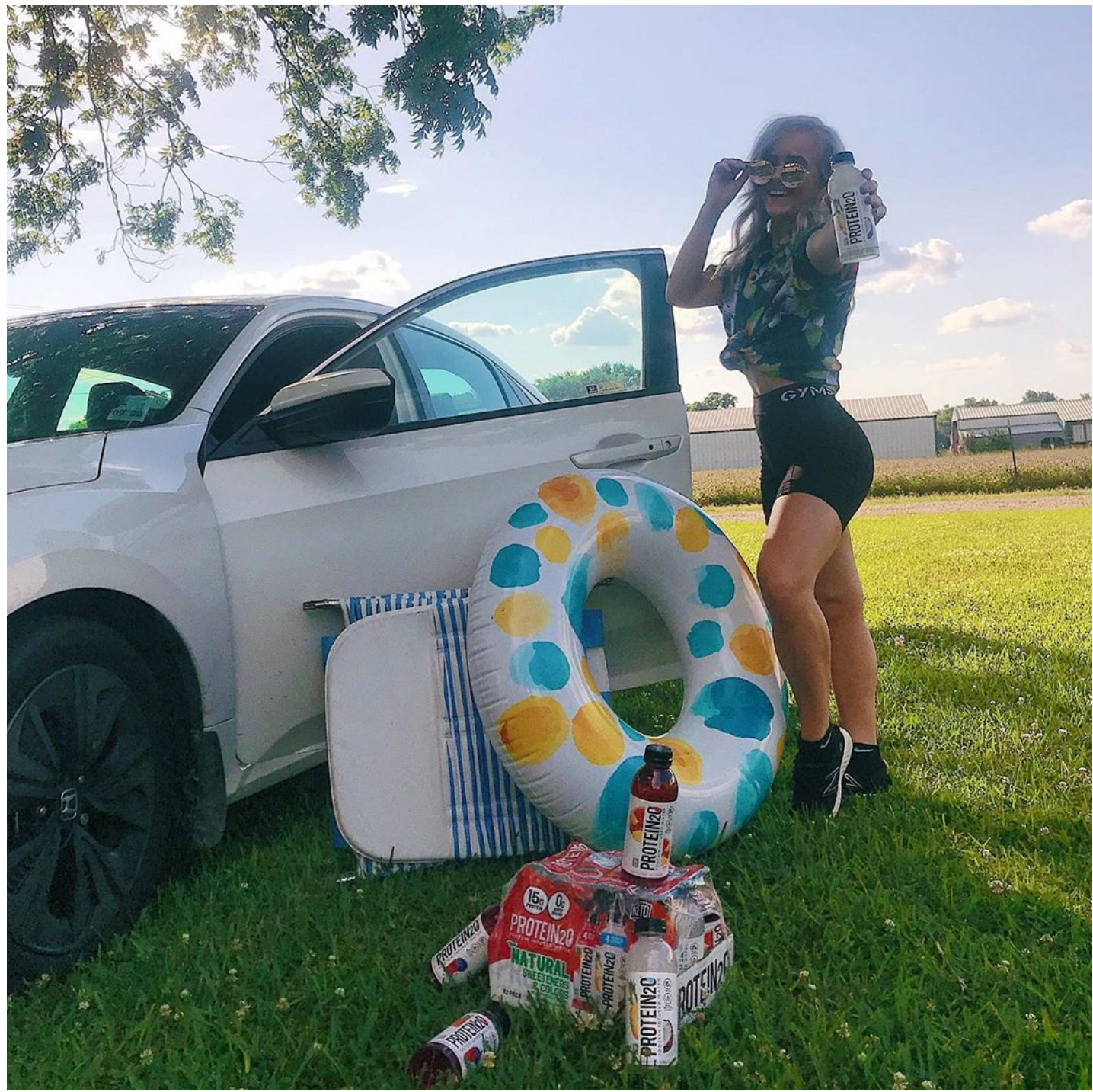
#fit #fitness #quarentena #emcasa #qualidadedevida #bemestar #motivação #motivation #workout #gym #muscle #musculacao #emagrecimento #emagrecer #core #consultoriaonline #instagood #style #lifestyle #personaltrainer #personalizados 1080