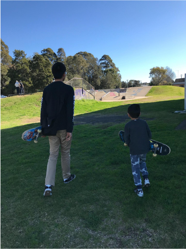
Father and Son (2019) - Skating with my Son, crafting valuable memories and shaping enriching life experiences and continuing on the Endless Wave