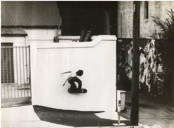
Wallride

Some spots are seen in videos or magazines and this may inspire us to seek to do something similar, while other places are discovered when you least expect it. However the ideas for Skateboarding come to you, the act and art of Skateboarding infuses these environments with new life and gives them a whole new reason for existing.