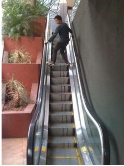
Escalator Slide (2009)