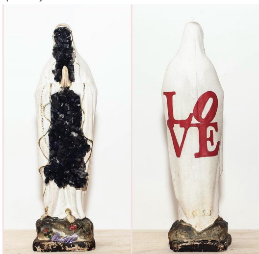
"LOVE for Skateboarding" by KillDie (2021)

KillDie's Crystal Mary sculptures represent many things; personal transformation, merging worlds, cycles of life and death, revival and reincarnation. Dedicated energy, action and intent = creation and new life, which are all themes that often recur in Sculpting and Skateboarding.