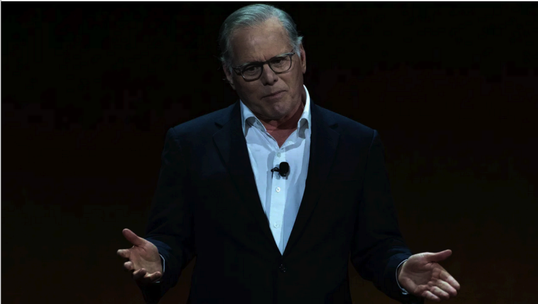
David Zaslav, President & CEO, Warner Bros. Discovery speaks during Warner Brothers Pictures CinemaCon 2023 presentation at Caesars Palace on April 25, 2023 in Las Vegas, Nevada.

(2023, July 3). How Warner Bros. Discovery CEO David Zaslav Became Public Enemy Number One in Hollywood. Archive.Today. Retrieved July 4, 2023, from https://archive.ph/2023.07.03-160323/https://www.gq.com/story/david-zaslav-warner-bros-discovery-ceo-tcm-max