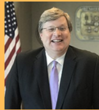
Jim Strickland Mayor of Memphis