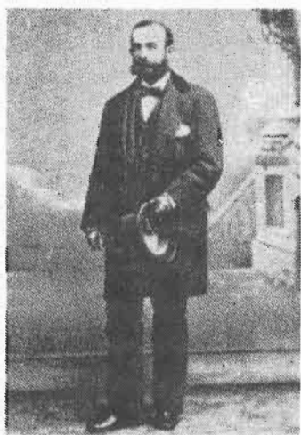
Daniel C. Gilman in the early seventies as president of the University of California.