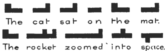
The visual patterns of words in two sentences

Why? That we shall see as the story progresses.