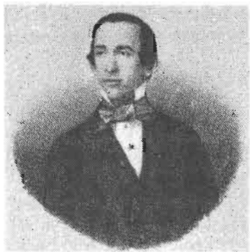
Daniel C. Gilman in 1852 as a senior in Yale College.