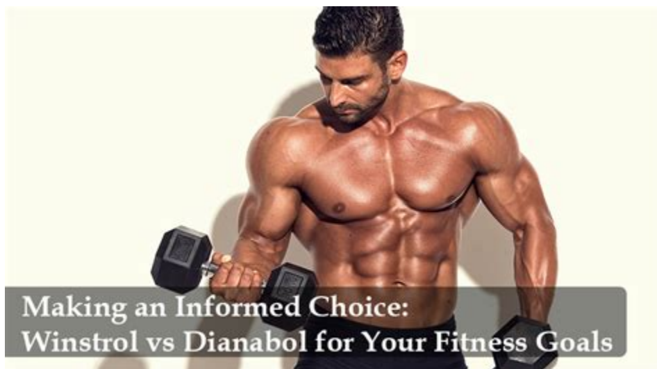
Table of Contents show Dbol vs Winstrol Comparison table Dianabol and Winstrol Comparison table Winstrol vs Dianabol - Overview What is Winstrol? Winstrol is a brand name for the synthetic drug Stanozolol. It's a man-made steroid that has similar effects to testosterone.