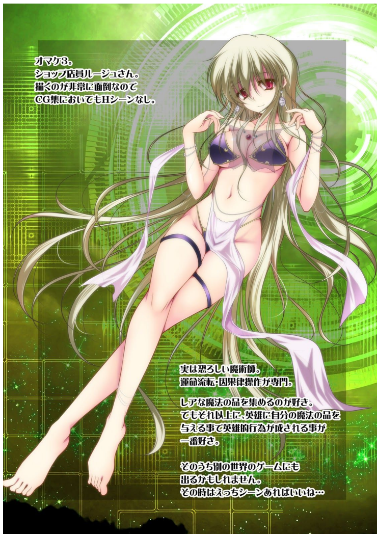
Madam Rouge Occult Shop Keeper

If you have the "Got to Pay the Way" Drawback, this location is considered your collateral for the jump. You cannot lose the shop, but paying for maintenance becomes a bit more than profits can manage. An extra space is added to the basement level for this drawback though — a sex dungeon. There, you may sell your services on either side of the BDSM spectrum to help pay off your debts. After the jump, the sex dungeon maybe toggled at will on a jump by jump basis.