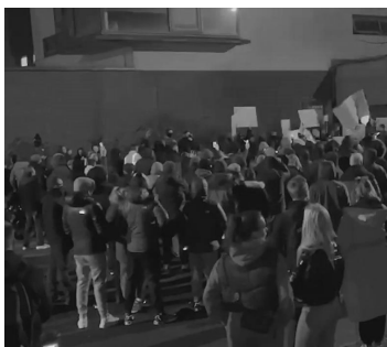
Protest outside Finglas Garda station

refugee men are "rapists", posing an extreme danger to local women and children, they repeatedly claimed migrants were involved in Friday's alleged attack. When it was correctly pointed out that the rapist in question was actually white and Irish, those that had spread the false stories dug in deeper, calling the media, the Gardaí and indeed the Actual Victim herself, liars.