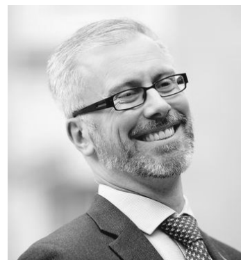
Roderic O'Gorman, Minister for Integration

The statement continued, 'Having spoken to many residents, it is clear to us that there is real anger towards Government policies, the ongoing failures in addressing housing & homelessness issues, the health service, the impact of the economic crisis, etc. None of these issues can be addressed by the current protests.'