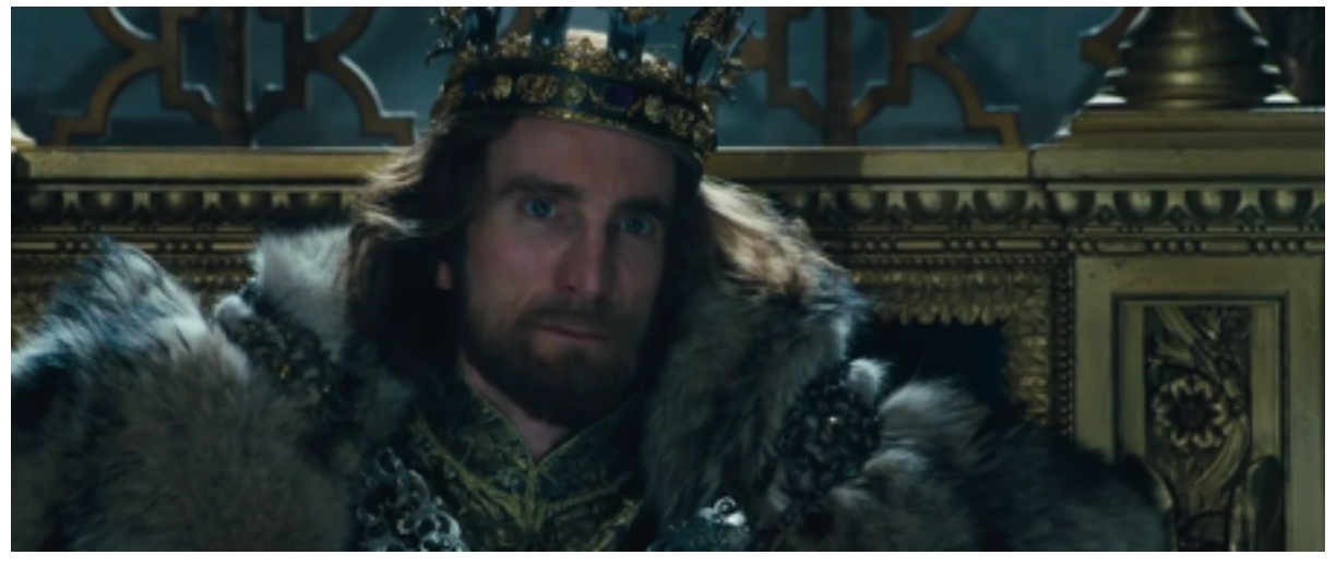
Figure 4: King Stefan

and the inevitable happens. Maleficent finds the Prince and takes him to the sleeping beauty in an attempt to save her, but the kiss fails because in this fairy tale true loves kiss after meeting a prince once isn't true love. Maleficent goes in and tells Aurora of her sorrow and regret, giving her a kiss on the head before leaving which wakes Aurora up because in this fairy tale, true love's kiss doesn't have to come from a romantic partner.