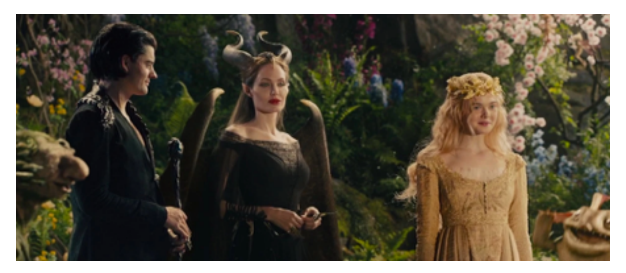
Figure 6: Aurora becomes Queen of both worlds.

is next in line to the throne (since her mother died whilst Stefan was planning the battle) and Maleficent crowns her Queen of the Moors, the long ongoing conflict between the Kingdom and the Moors is over and is ruled by someone with pure intentions and qualities. It took someone both hero and villain to resolve the main problem in the story.