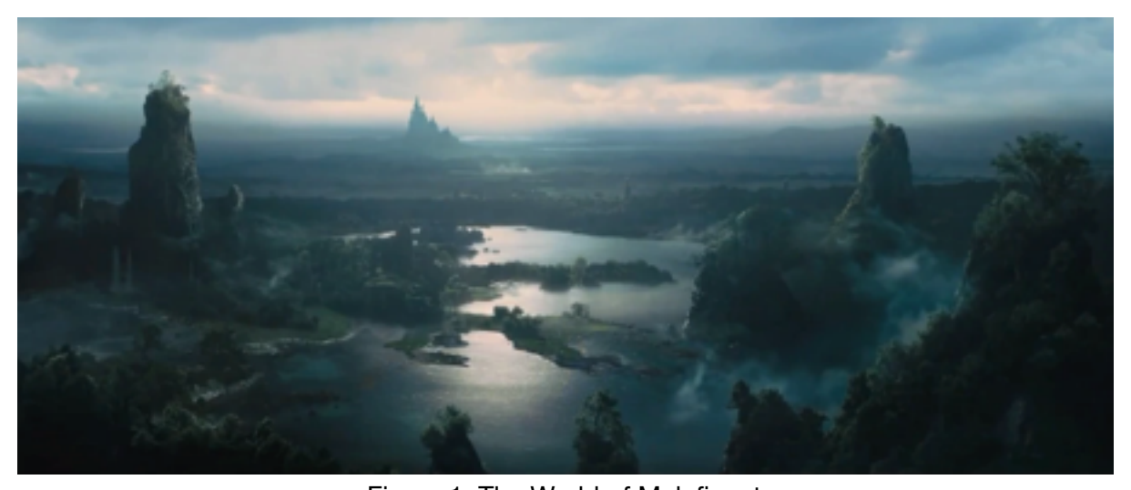
Figure 1: The World of Maleficent

Maleficent is a postmodern adaptation of Sleeping Beauty which focuses on the villain Maleficent and tells her story before and after Aurora (Sleeping Beauty) is born. Before this film everyone knew Maleficent as the wicked witch who placed Aurora under a curse, that on her sixteenth birthday she would prick her finger on the spindle of a spinning wheel and fall into a sleep like death, which could only be broken by true love's kiss. No one ever knew why Maleficent was so wicked, why she placed her curse, why does she have a staff or even why she has a raven as a sidekick of all creatures. The two characters discussed in this review are Maleficent and King Stefan who are equal but opposite, protagonist/antagonist vs antagonist.