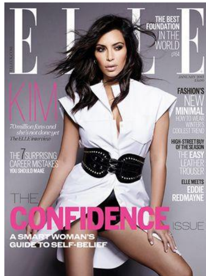
An example of a fashion magazine

The purpose of fashion photography is to promote new trends in fashion and also provides a platform for fashion models to become more popular through these pictures. These Fashion photos promote new models and new trends in the fashion industry.