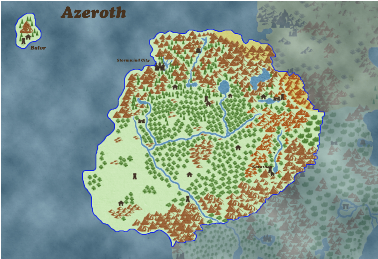
Azeroth before the First War

Estimated population: Around 23 700 000 souls at the beginning of the First War.