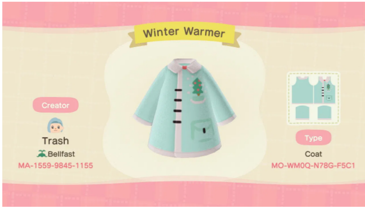
ACNH Winter Clothes Code 6 - Sweater Collection by @ellenscrossing