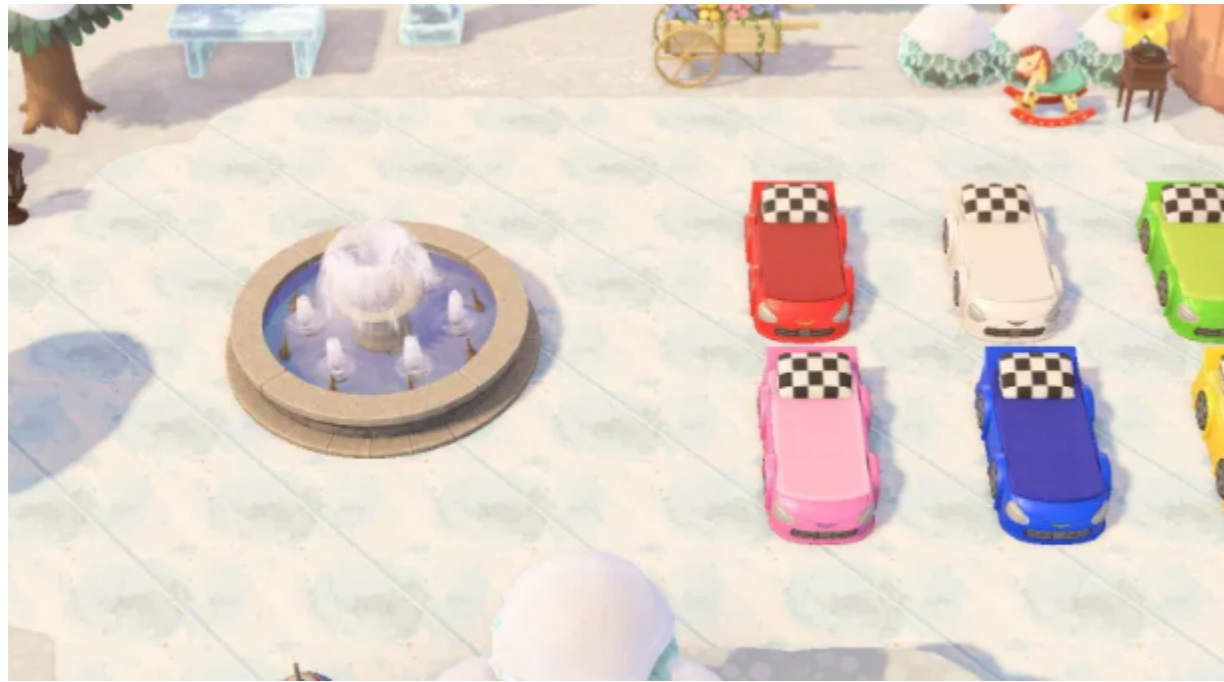
ACNH Winter Path Code 10 - Winter Sparkles by Miss Apple (u/SneakyKaz)