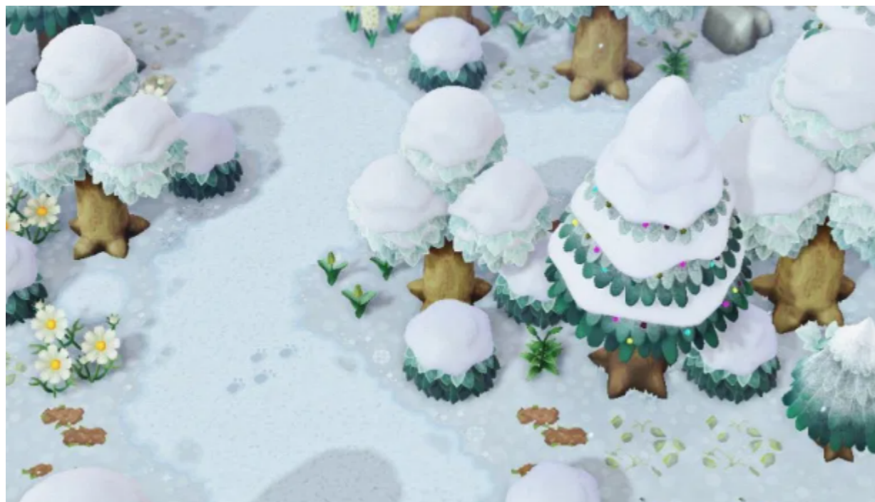
ACNH Winter Path Code 9 - Ice Flooring by @moguranohoppe_m