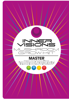
MUSHROOM GROW KIT MASTER