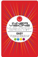
MUSHROOM GROW KIT EASY Available in multiple varieties.