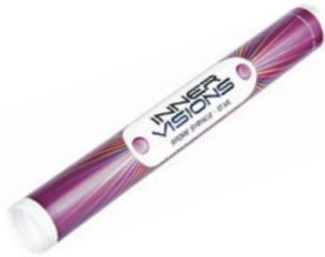
MUSHROOM SPORES A wide variety of spore syringes.