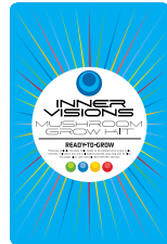
MUSHROOM GROW KIT READY-TO-GROW Available in multiple varieties.