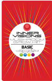
MUSHROOM GROW KIT BASIC