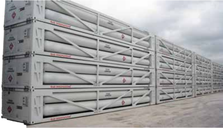
Large fleet of assets for your job requirements