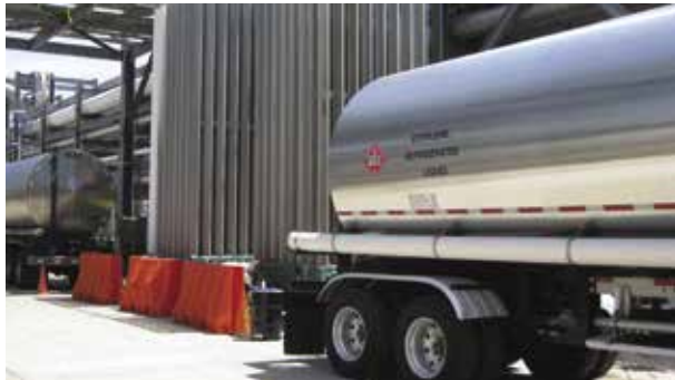
Interim gas flow outages utilizing 2-80 K vaporizers