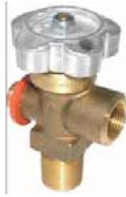
CGA 510 Diaphragm Valve (Repressurization model also available)