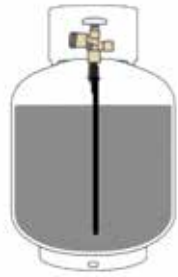
Liquid Withdrawal (Dip Tube / Syphon Tube)

Gas Innovations low pressure cylinders are free of any residual oil & particulate that accumulates during the cylinder manufacturing process. Cylinders are available in a variety of sizes for both liquid and vapor withdrawal applications. Each cylinder package is equipped with a CGA 510 diaphragm valve preventing contamination during vacuum / fill procedures. Cylinders are refillable and D.O.T. compliant.