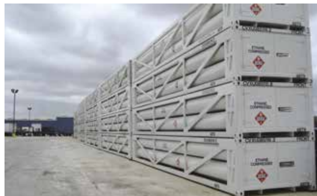
MEGC / ISO High Pressure Tube Modules