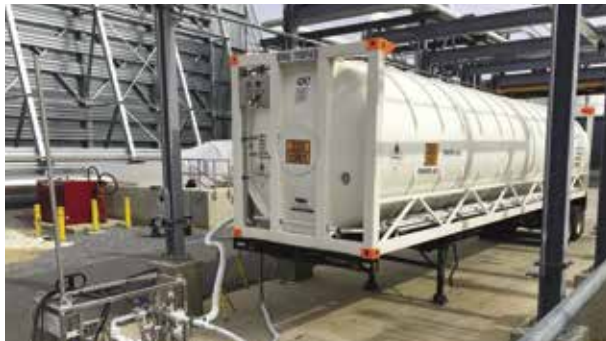
Innovative offloading designs