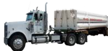
D.O.T. 3AAX MODEL