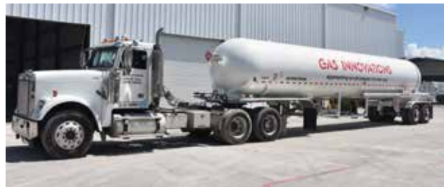
LP Transports Propane, Isobutane, Propylene & Butane