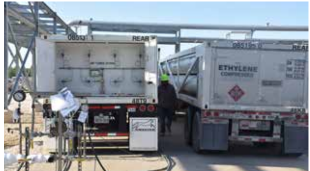
Turnkey supply for pipeline curtailment