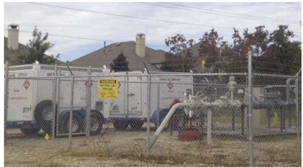
Residential utility pipeline support