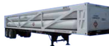
D.O.T. 3T MODEL