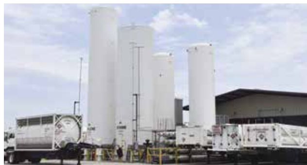
Hydrocarbon Storage Facility