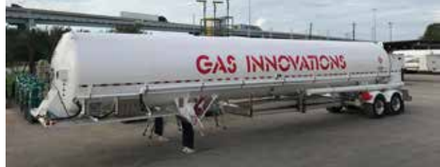
D.O.T. Cryogenic Transport Ethane, Ethylene & LNG