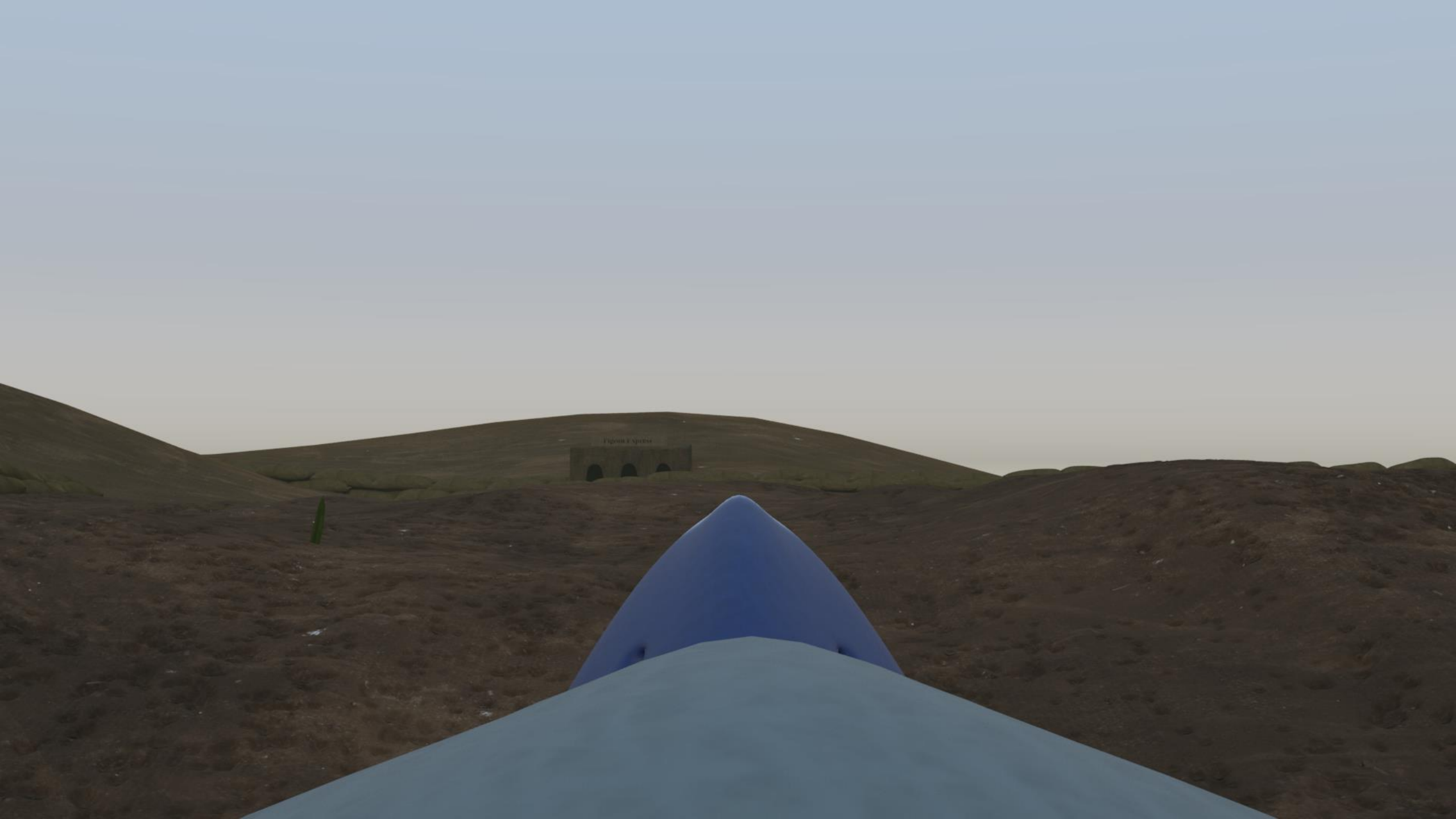
Figure 1: A small grey structure with three arched openings, possibly a tunnel or entrance, located on a sandy ridge in the distance.