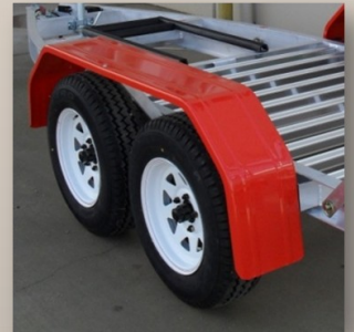
Robust steel mudguards.