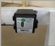
Electric breakaway brake system as