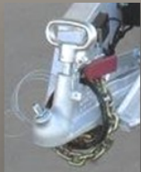
Top quality fittings.