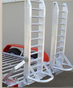
Hinged Aluminium Ramps.