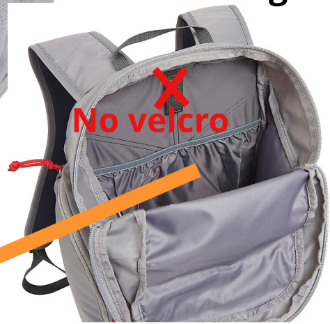
Kelty Redwing 22