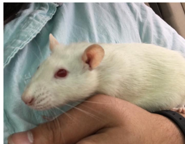
Meet Mia, My sweet rescue rat!

The cage should be cleaned on a weekly basis. Bedding and any cardboard boxes should be replaced. Permanent fixtures and accessories should be washed. There should always be food and water available.