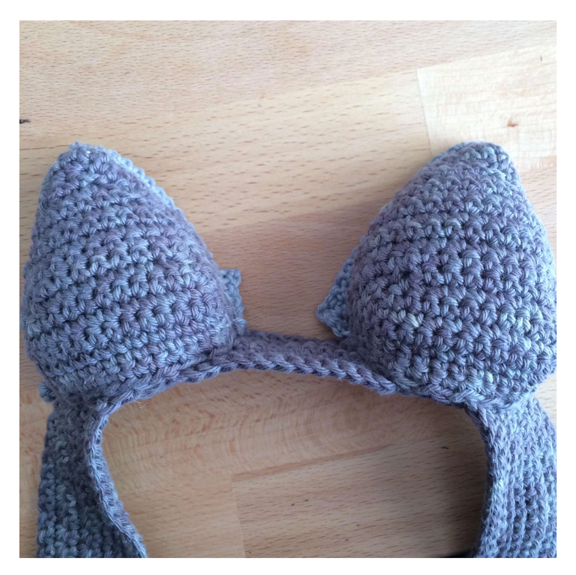
(back of the ears so you know what it looks like)

Ch 20 • Sc X2 (don't connect) • Dec at the beginning and end of the row, and just Sc in the middle • *dec twice, sc in the middle, dec twice again at the end of the row*X2 • dec, sc in middle, dec • sc all the way around(when going down the sides, if there is a big gap, Inc.) • *dec, sc in middle, dec*X6 • sc • sc down to both sides (not all the way around) •