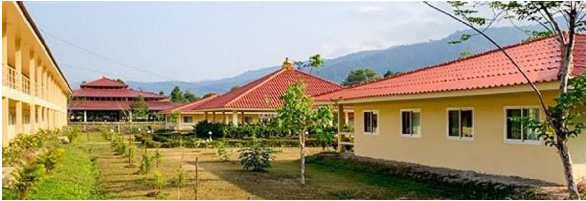
Rajapark Institute Training Center, in Chanthaburi, Thailand

Time is of the essence, so Meditators and Sidhas who are interested in joining life's highest and most fulfilling profession should immediately register their interest by completing the two forms below.