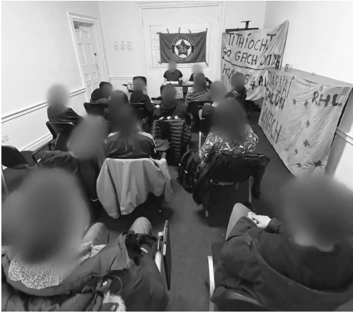
RHL public meeting, Galway City.