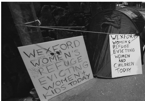
Wexford women's refuge protest.