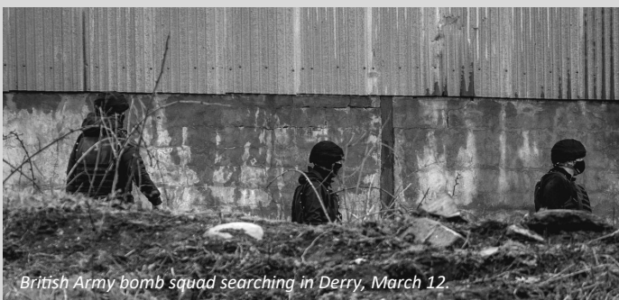
British Army bomb squad searching in Derry, March 12.

March 12- The RUC and British Army carry out searches on land at the Brae Head Road area close to the Creggan, Derry. The media links the searches to the IRA, which it refers to as the New IRA. Sometime later, the RUC and British Army come under attack by Republican youth defending their community and are forced to abandon the search. That evening, following repeated attempted incursions the RUC are again confronted by Republican Youth in the Magowan Park Area and are repeatedly driven out of the community.