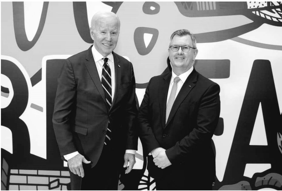
Jeffrey Donaldson of the DUP with Biden, Ulster University, April.

Jeffrey Donaldson could only muster a petulant response. 'I would urge the senator to read some history books. Maybe he'll learn a little bit more about what really happens and the reality of the situation.' Not only does Donaldson retain his own opinions, but also his own facts.