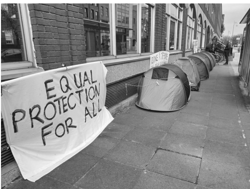
Tent protest and homeless camp at the IPO.

As the Free State's campaign against the housing conditions of the Irish people goes on, likewise does the resistance against it. The Revolutionary Housing League has been active across the country organising and defending the ordinary people against the pro-corporate, pro-landlord policies of the ruling class.