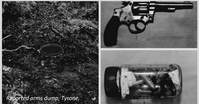
Reported arms dump, Tyrone.

March 23 - The RUC report that they have discovered a Republican arms dump on land at the Seskinore Road in Tyrone. Photos released by the media show a revolver, a shotgun and a jar of ammunition. The media state that the find is linked to the IRA, again referred to as the New IRA.