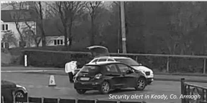
Security alert in Keady, Co. Armagh

March 7- A number of mainstream media outlets report on a bomb at the Castleblaney Road in Keady, Armagh. The RUC establish a large cordon in the area closing 6 roads. Footage released by Republic Media online shows British Helicopters circling the area and British Army troops at the scene. It was further reported that a controlled explosion was carried out.