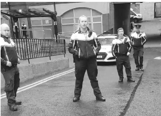
Gardai harassment of homeless refugees at the IPO.