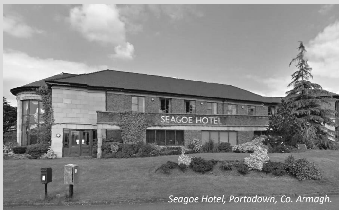
Seagoe Hotel, Portadown, Co. Armagh.

March 28- MI5 increase the Republican threat level from substantial to severe, stating that it is believed that a Republican Military Operation is highly likely and could occur at anytime. This change to the Republican threat level follows a marked increase in Republican military operations from November 2022, since when a military operation has taken place each month against the British forces of Occupation and in some months there have been several separate operations reported by the media.