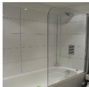
Bathroom and noisy extractor