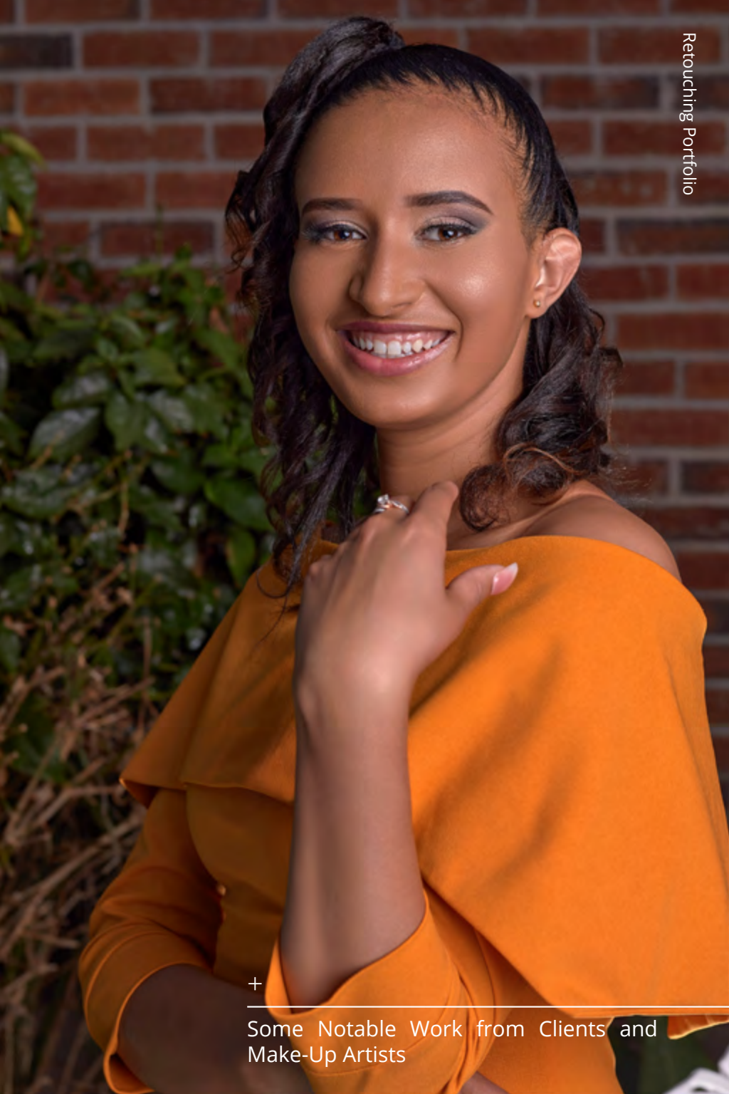
+ Some Notable Work from Clients and Make-Up Artists