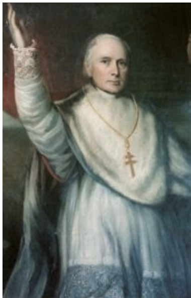
The Frankist Archbishop Daniel Murray (Murzynski) of Dublin

Sabbateans - and those who followed the other daughters of Frank from his first marriage whose leadership became based in Italy, Spain and Ireland and they became a leaven in the Catholic Church for a Rome-focused mystical, liturgical and devotional renewal of Catholicism. Beginning in about 1790 some of the non-baptised Hasidic secret Frankists joined the Catholic devotional Frankists in the Catholic Church and there was a further influx in 1820 under the son of the Alter Rebbe- Reb Moshe ben Zalman (Leon). These anti-Sabbatean Frankists or Zoharists can also be called Papal Frankists.