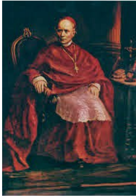
The Frankist Cardinal Paul Cullen (Cohen) of Dublin