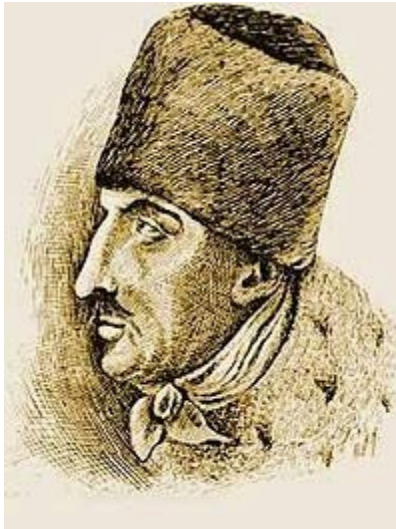
HaMoranu Jacob Leib Frank

Jacob Frank said that the reason that Poland was the first place that the Frankists chose to become Catholics is because they were the nation that understood the Mother best. The Papal Frankists who went to Ireland were to bring this intense Marian focus with them and under the Papal Frankist priests, Bishops, nuns and laity they inaugurated a new era of Marian fervour in Irish Catholicism. It was the hidden Frankists in the Church of Europe that pushed for the dogmas of the Immaculate Conception and Papal infallibility.