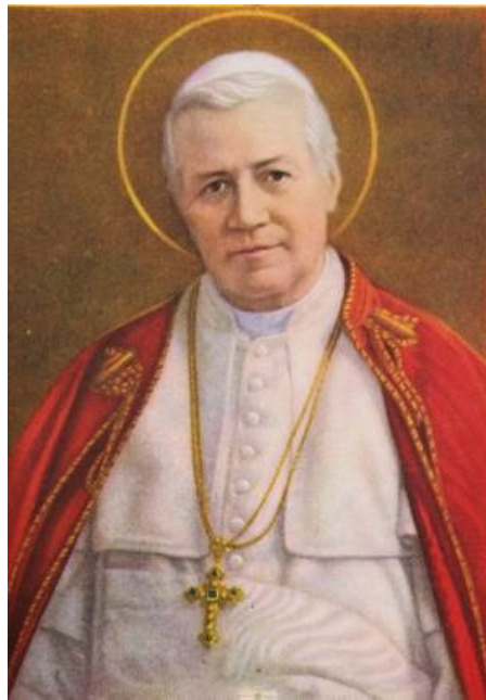
The Frankist Pope St. Pius X- the beautiful fruit of the Papal Frankists

the Frankists to maintain openly their Jewish customs and practices in the Church as a Jewish rite similar to the Chinese rites proposed by the Jesuits in China. However the anti-semitic and anti-Jesuit forces in the Church of the 18th century prevailed on the Bishops to deny this request. This was when Frank decided that the Frankists must remain in silence and hiddenness as a Jewish mystical leaven in the Church to prepare it to become the Church of the new era that would be truly mystical and universal.