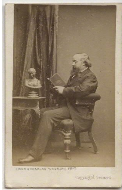
Edmund Burke Roche, 1st Baron Fermoy a great-grandson of Jacob Frank