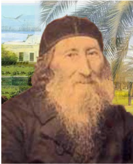
Tzvi Hirsch Kalischer a great-grandson of Jacob Frank