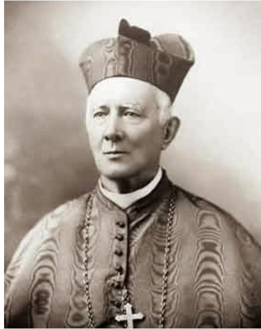
The Frankist Cardinal Patrick Francis Moran of Sydney