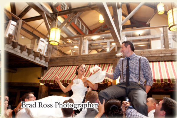
Brad Ross Photographer