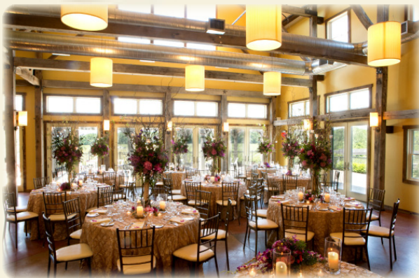
The Studio Photographers