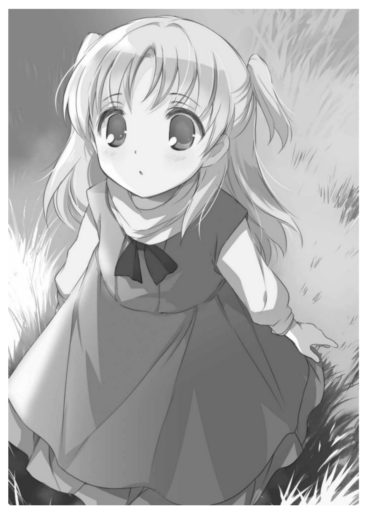
"No... way," the woman murmured with a quivering voice, both hands covering her mouth. "No... that can't be..."

"Eh? Eh?" The girl, unable to comprehend the situation, rapidly looked back and forth between the young man and the woman.