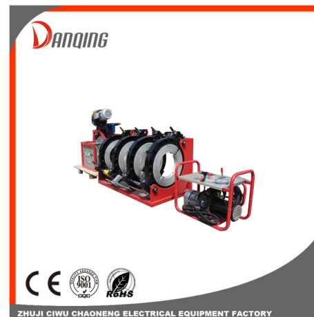
200MM HYDRAULIC BUTT FUSI...

( https://www.danqingtools.com/product/pipe-welding-machine/double-heating-element-series/7n0a1977.html )