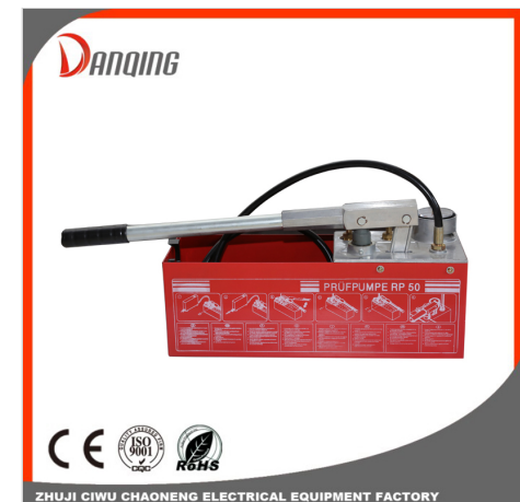
CN-5.0MPA-M HYDRAULIC TEST...

( https://www.danqingtools.com/product/plastic-pipe-cutter/cn-733-1.html )