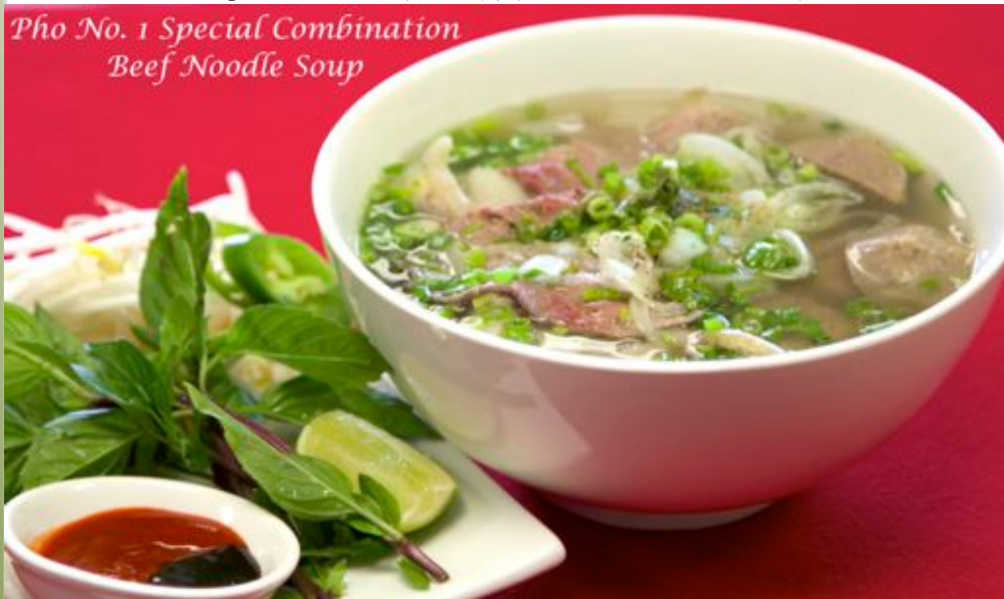
Pho No. 1 Special Combination Beef Noodle Soup