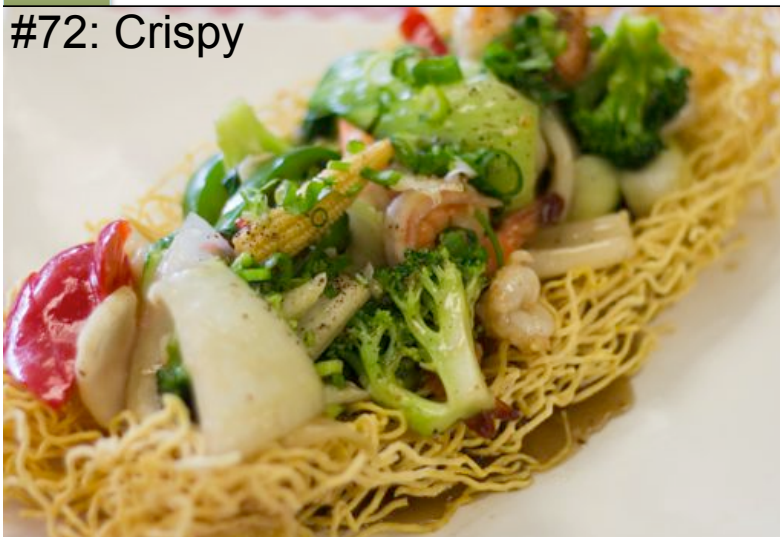
EGG NOODLE STIR-FRY WITH SEAFOODS