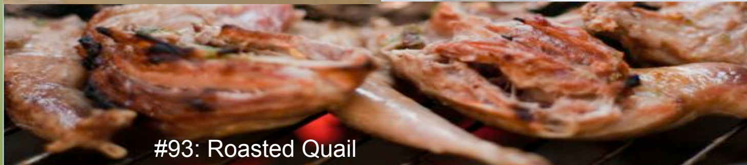
#93: Roasted Quail